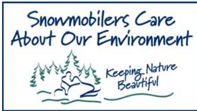
American Council of Snowmobile Associations